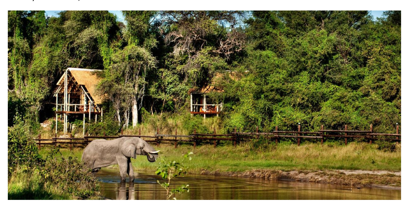
The Luxury Safari Suites are raised on expansive private decks with en-suite bathrooms comprising of a shower, hand basin and toilet.

Located on the banks of the Savute Channel, Savute Safari Lodge is intimate, accommodating only 24 guests in cool thatched timber and glass suites. The area is renowned for its population of bull elephant and for the unique interaction of the resident predator species. The close proximity of wildlife translates itself into the recently refurbished, modern African décor.